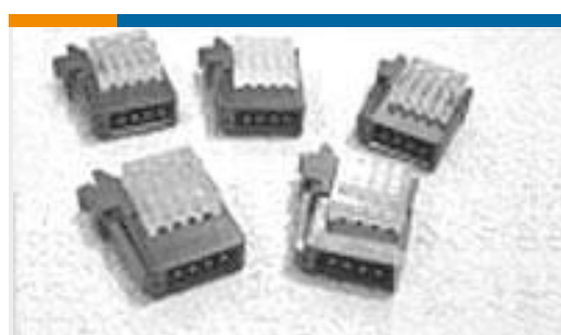
TE Part #1-1473562-4 RITS CONN. PLUG ASSY 4P RED