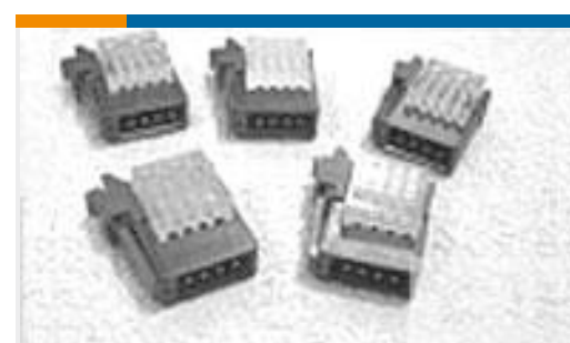
TE Part #4-1473562-4 RITS CONN. PLUG ASSY 4P GREEN