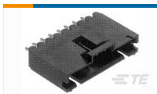
TE Part #5-103908-6 07 MTE HDR SRST LATCH W/HLDWN