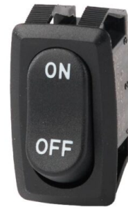
R13-238 Series Rocker Switch