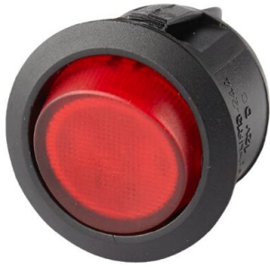
R13-244 Series Rocker Switch