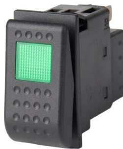
R13-289 Series Rocker Switch