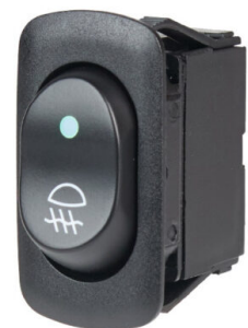
R13-263 Series Rocker Switch