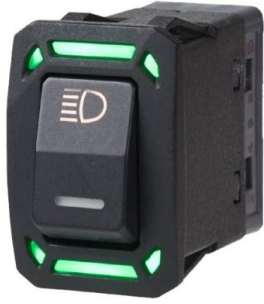
R13-312 Series Rocker Switch