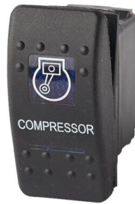
R13-305 Series Rocker Switch