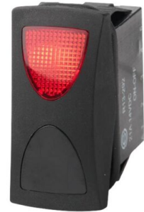
R13-292 Series Rocker Switch