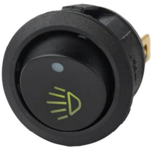
R13-273 Series Rocker Switch