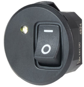
R13-308 Series Rocker Switch