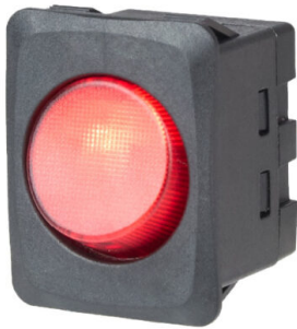
R13-307 Series Rocker Switch