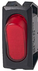
R13-242 Series Rocker Switch