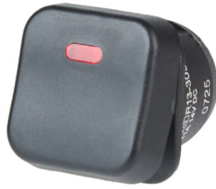
R13-309 Series Rocker Switch